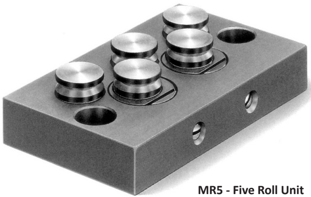
MR5 - Five Roll Unit