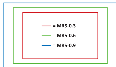
APPROXIMATE ACTUAL SIZES